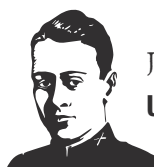
JAMES BALLENTINE VFW POST 246 UPTOWN, MINNEAPOLIS

James Ballentine VFW Post 246 provides a crucial link between veterans and the community of Minneapolis area. JB Post 246 links new age feel with old school principles. Our goal is to provide a place for veterans to come and have a sense of responsibility post military, while enhancing the surrounding community.